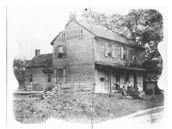
Pine Tavern. Established c1750, this old hostelry stood on Pine Tavern Rd near Mood's Farm Market.

The exhibition is accompanied by recorded narratives and songs drawn from local history. Hear about "tavern crawls" before the Civil War, what made Richwood's tavern so notorious, a temperance meeting in Ewan and a raid on a bootleg still in Richwood. Scan the QR codes in the gallery to listen to these fascinating stories. Be sure to stop by and bring along your family, friends and neighbors to discover Old Harrison's "spirited past."